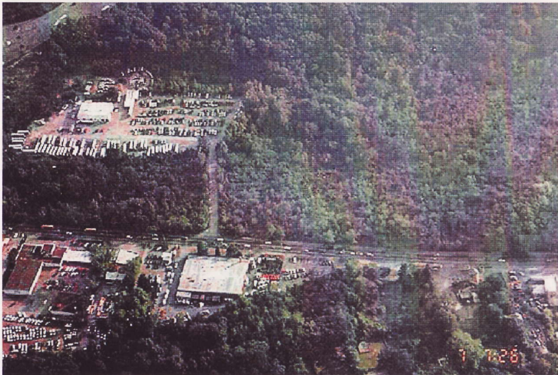
A new center lane on Route 202/35 would alleviate congestion from traffic making left turns in to businesses.

Under either scenario, bike lane striping or shoulder treatments for biking should be provided. This improvement has already been placed on the regional multi-year Transportation Improvement Program, a necessary step for the use of federal funds.