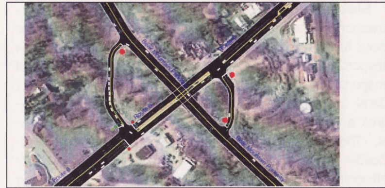
Example of visual image created by simulation model showing vehicles on roadways.

In another valuable role, the model will be used by the three municipalities as a tool in the review of traffic impact statements prepared for development proposals. In conjunction with the travel demand model, the simulations will permit testing of the impacts on traffic flow as well as air quality parameters. Use of the model will ensure that potential