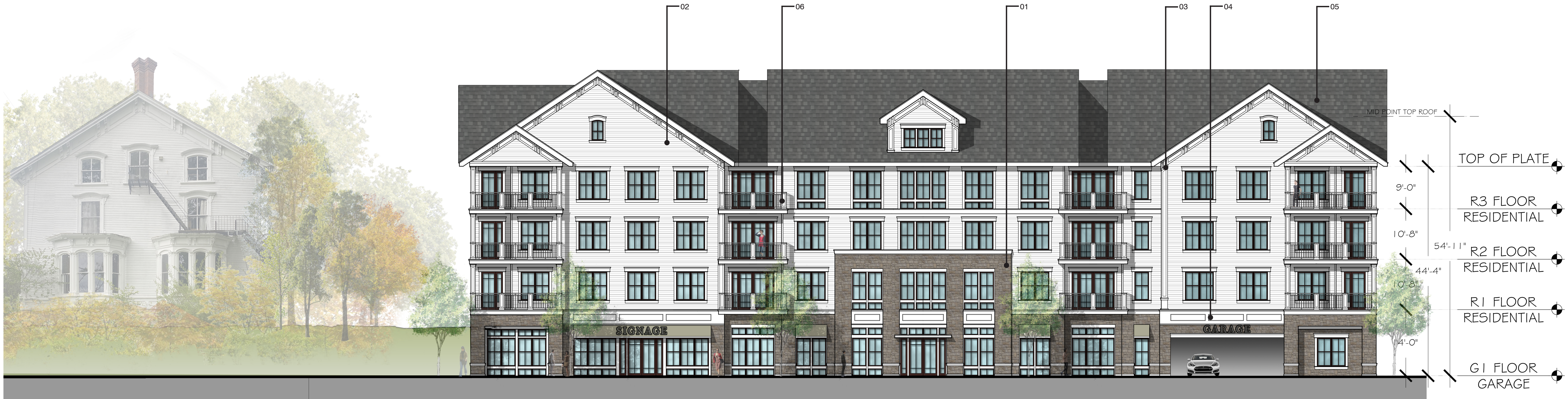
BUILDING ELEVATION 2