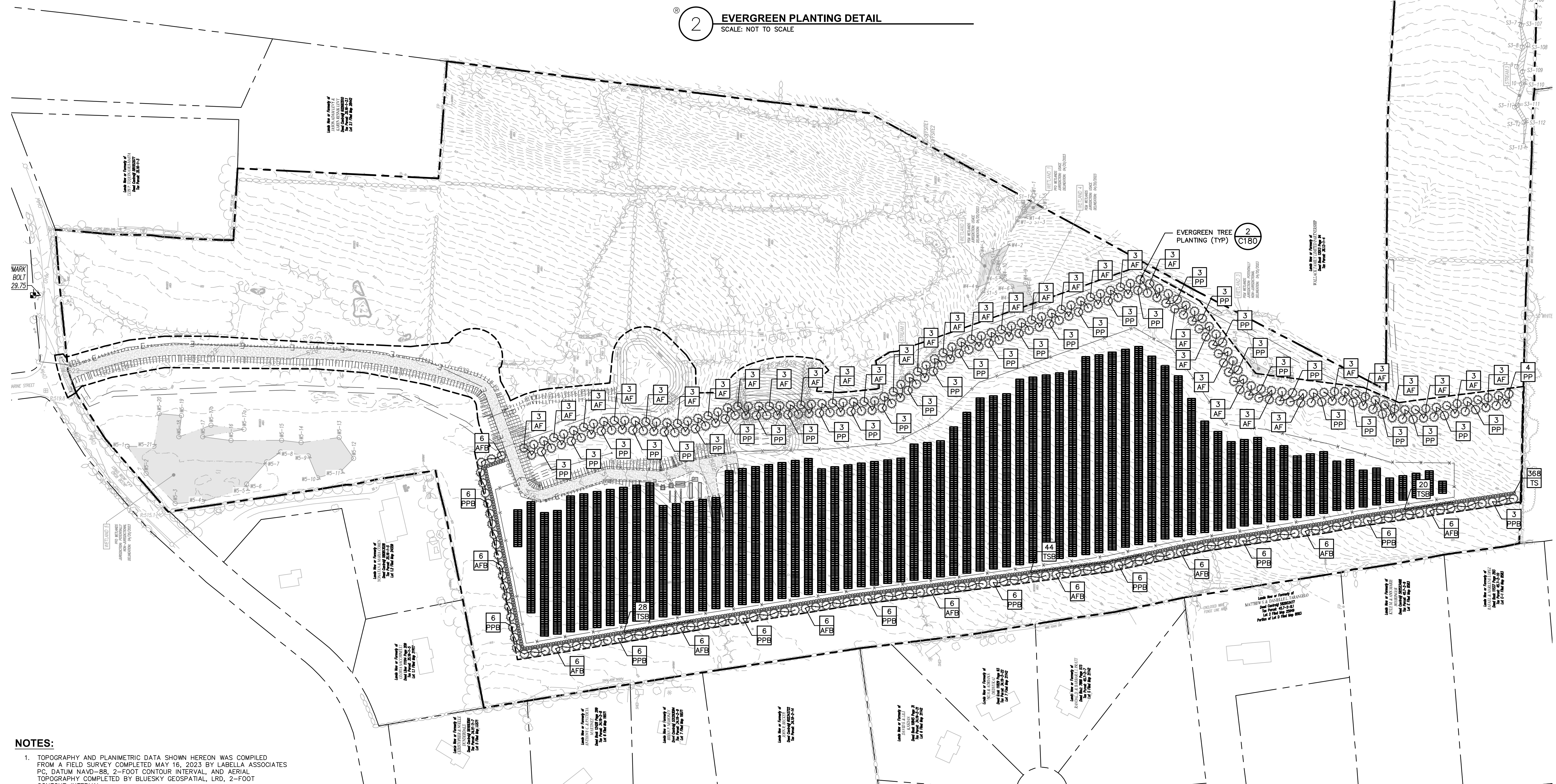
2 EVERGREEN PLANTING DETAIL SCALE: NOT TO SCALE