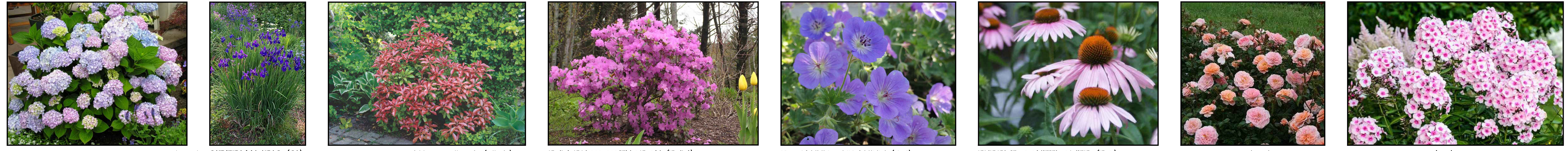
ENDLESS SUMMER HYDRANGEA (ESH) SIBERIAN IRIS (SI) MOUNTAIN FIRE ANDROMEDA (MFA) PJM RHODODENDRON (PJM) ROZANNE GERANIUM (RZ) PURPLE CONEFLOWER (PC) DRIFT ROSE (DR) GARDEN PHLOX (PH)