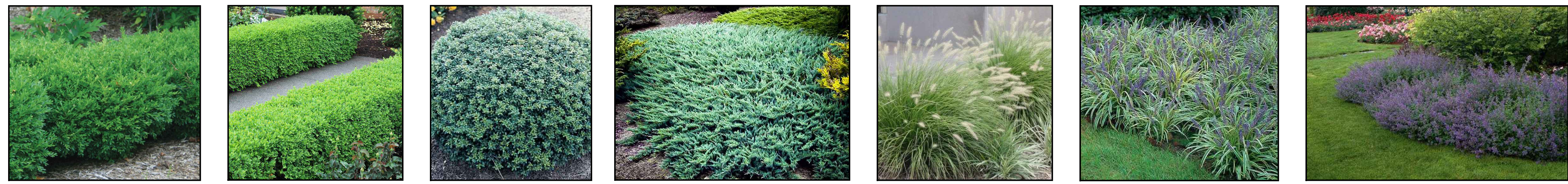
FRANKLIN GEM BOXWOOD (FBX) GREEN VELVET BOXWOOD (EVBX) SOFT TOUCH HOLLY (STH) BLUE RUG JUNIPER (BRJ) LITTLE BUNNY GRASS (LBG) VARIEGATED LILYTURF (LT) CATMINT (CT)