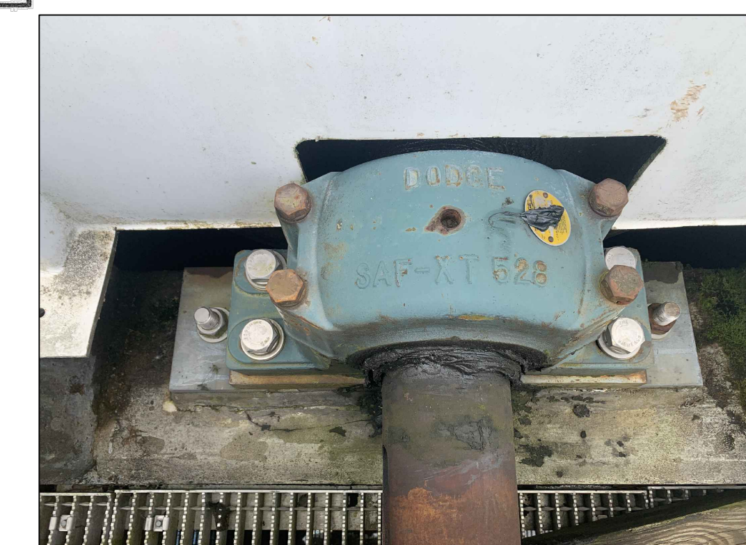
TYPICAL IDLER BEARING