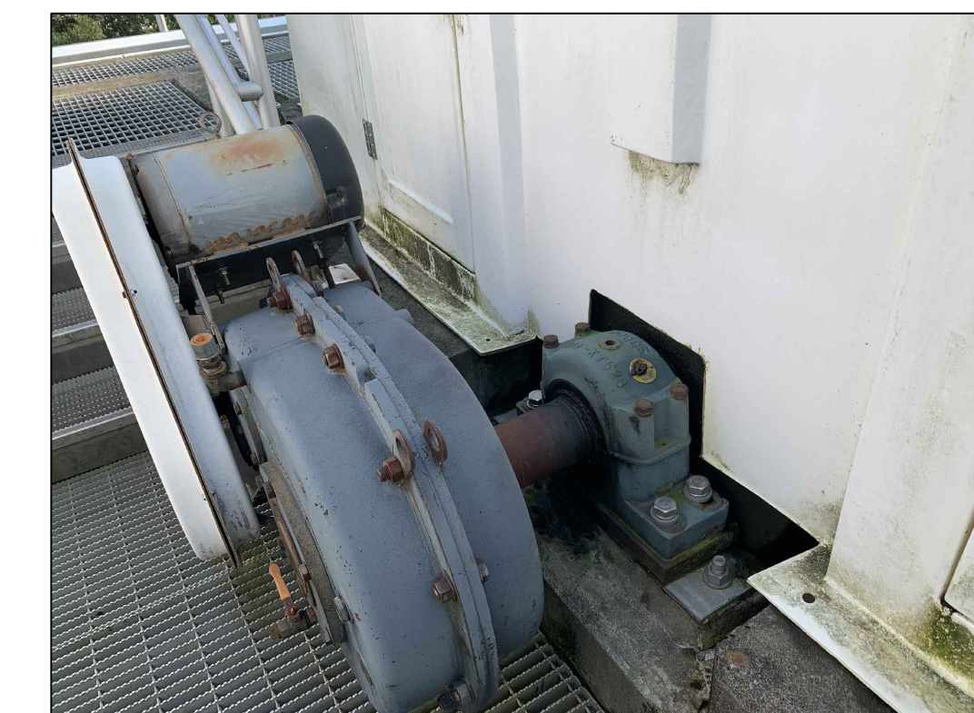
TYPICAL DRIVE BEARING